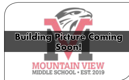
Mountain View Middle School 30 Bali Hai Road Mechanicsburg, PA 17050 Phone: 717-697-1960