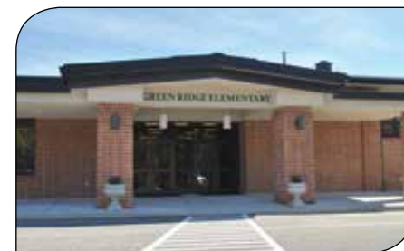
Green Ridge Elementary School 1 Green Ridge Road Mechanicsburg, PA 17050 Phone: 717-766-4911