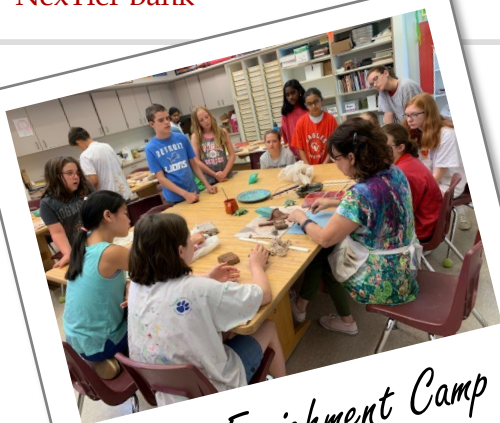
2019 Enrichment Camp

Visit cvschools.org/eaglefdn Call 717-506-3351