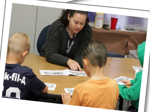
2019 Reading Camp