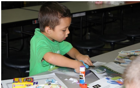
Reading Booster program

Integrity Bank M&T Bank Metro Bank Mid Penn Bank Orrstown Bank Pennsylvania American Water Phillips Office Solutions PNC Bank United Concordia Dental Weis Markets, Inc.