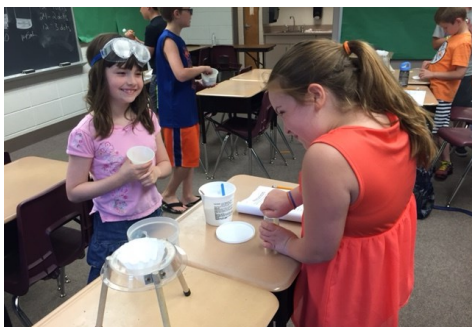
2016 enrichment camp