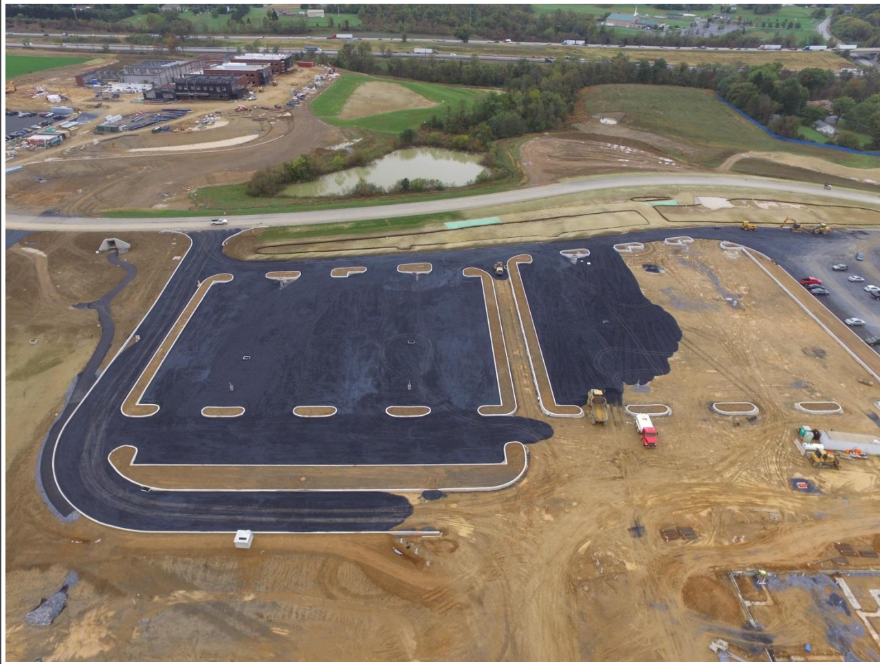
York Excavating placing stone subbase for the Middle School parking area