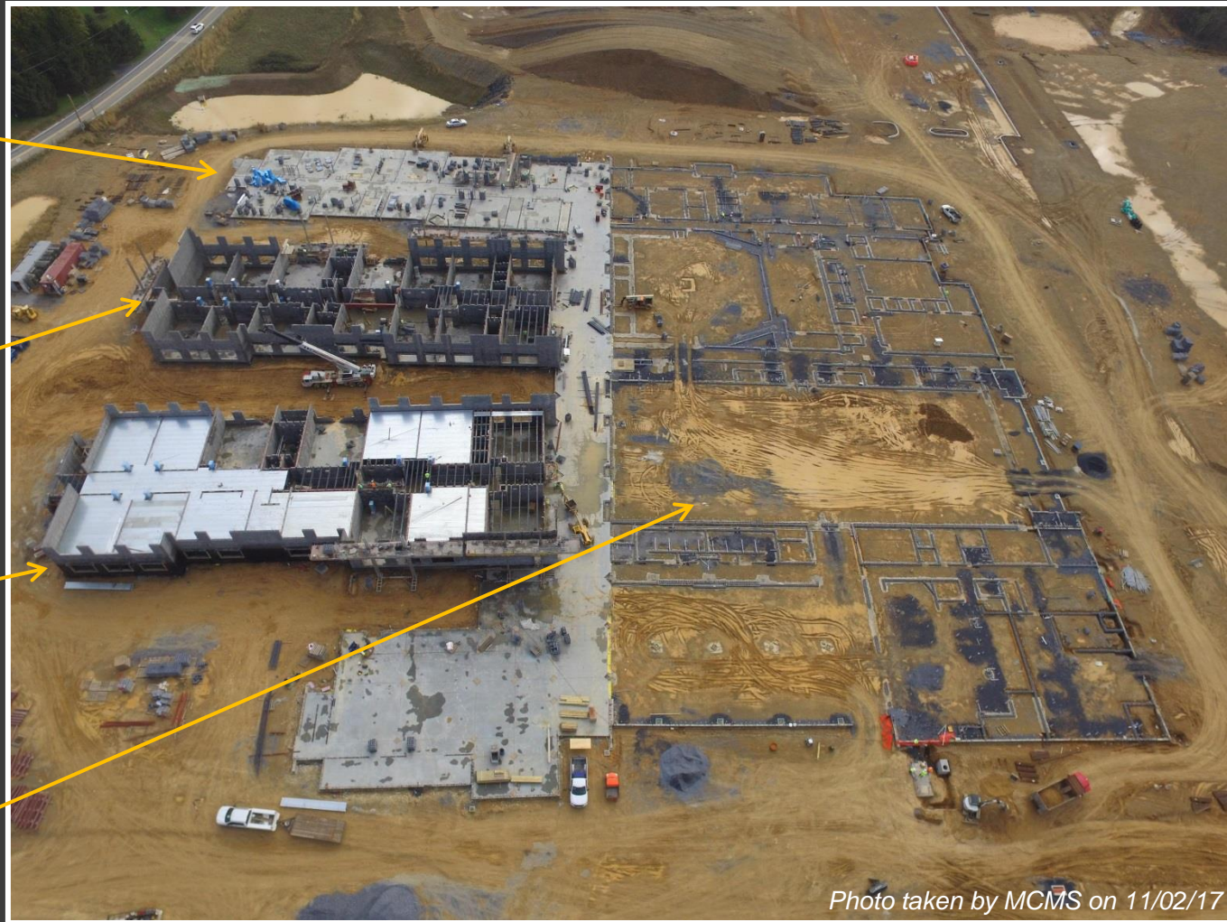
on 11/02/17

Areas D & E – Footings now complete; underslab rough-ins ongoing