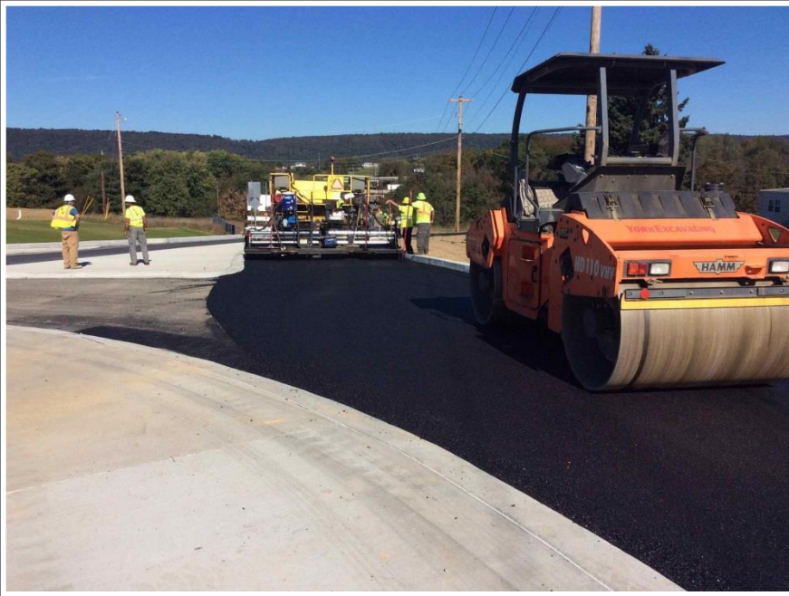
Paving & line striping of the Roundabout