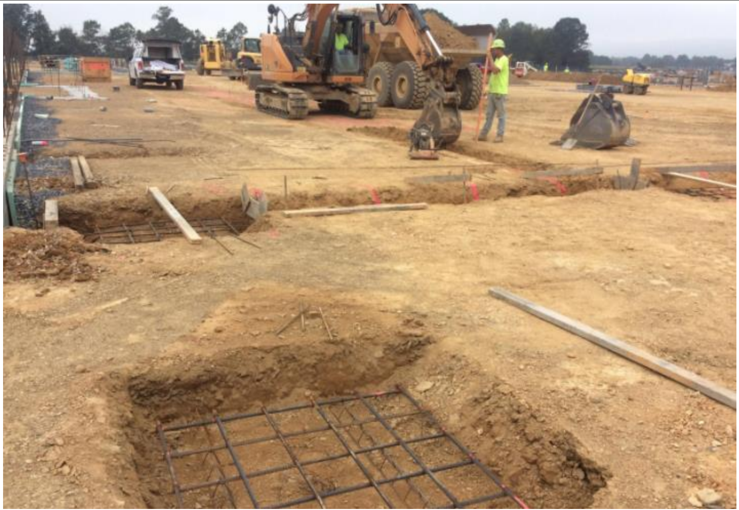
Footer excavation and reinforcement installation in Area D