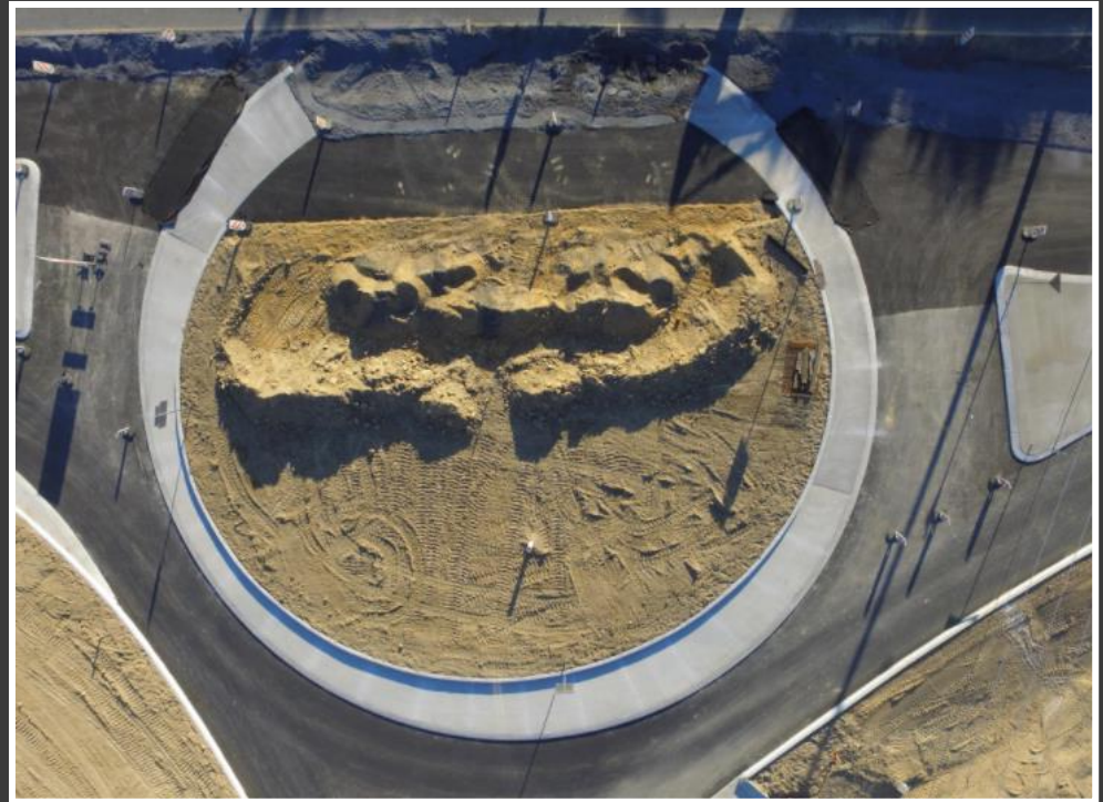
Close-up of Roundabout circle