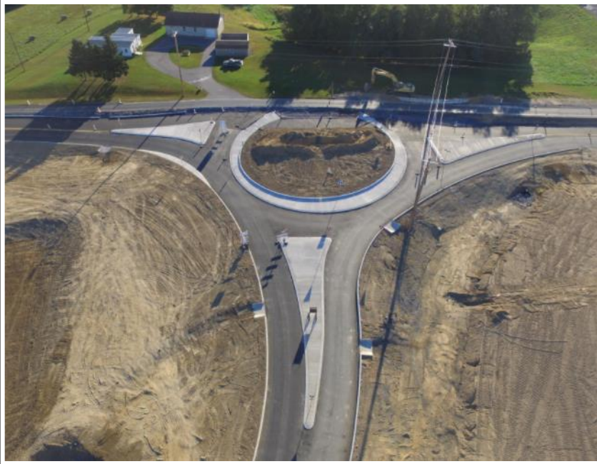
View of Roundabout from the Relocated Bali Hai Road