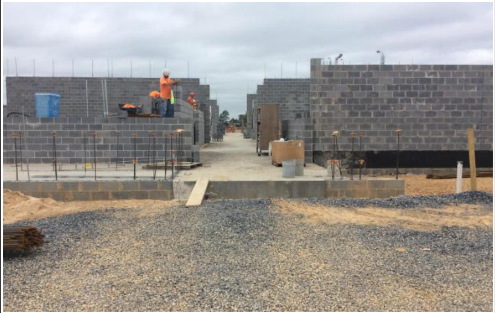
Area A – First floor masonry wall progress