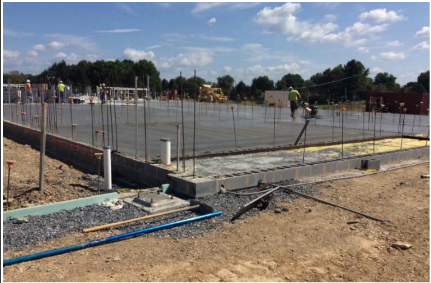
Lobar – Finishing slab placement for the West half of Area C