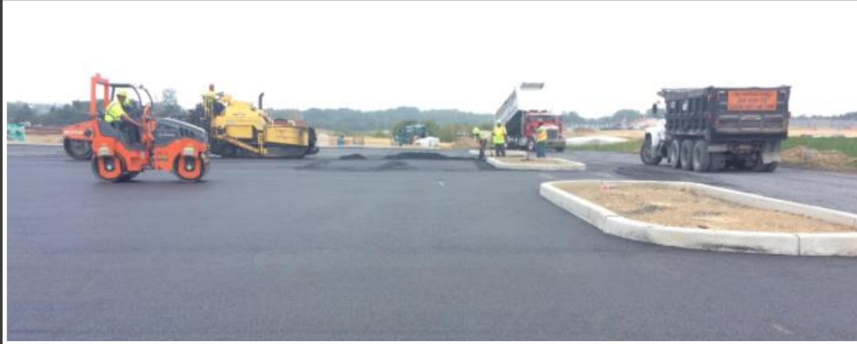
Placed base course of asphalt in the elementary school parking area