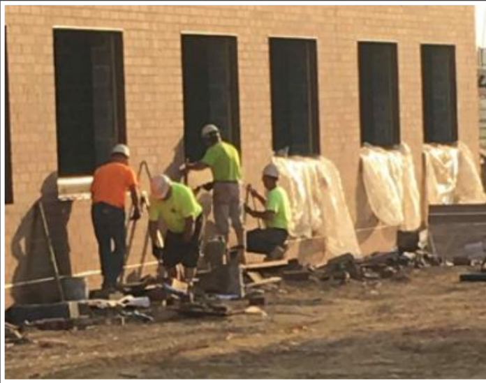
Installation of the exterior brick veneer and the precast concrete window sills in Area A