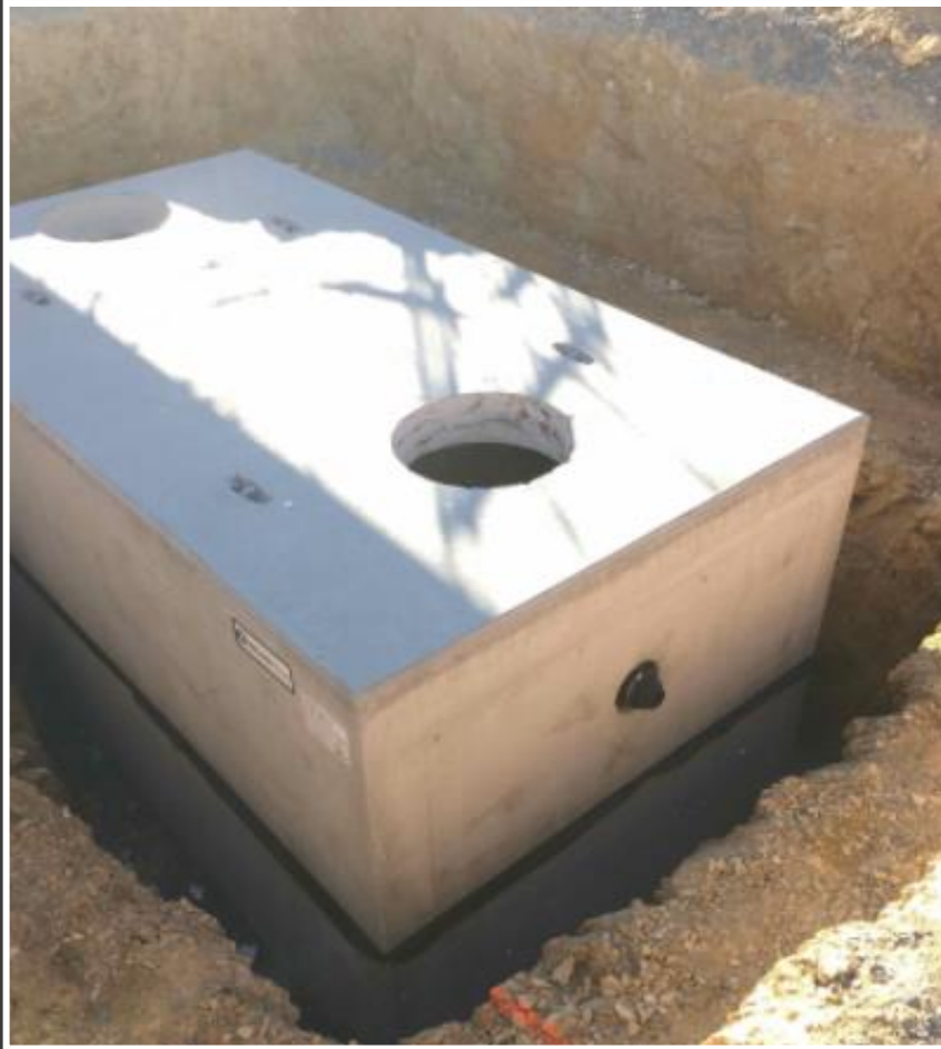
Grease interceptor for Kitchen area installed