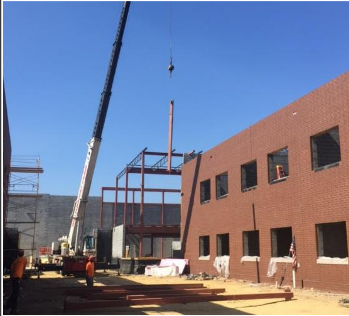
Structural steel installation for Main Street in Area A