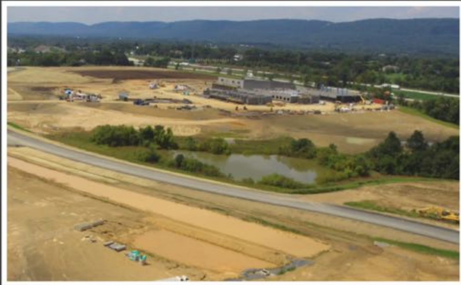
View looking from the Middle School