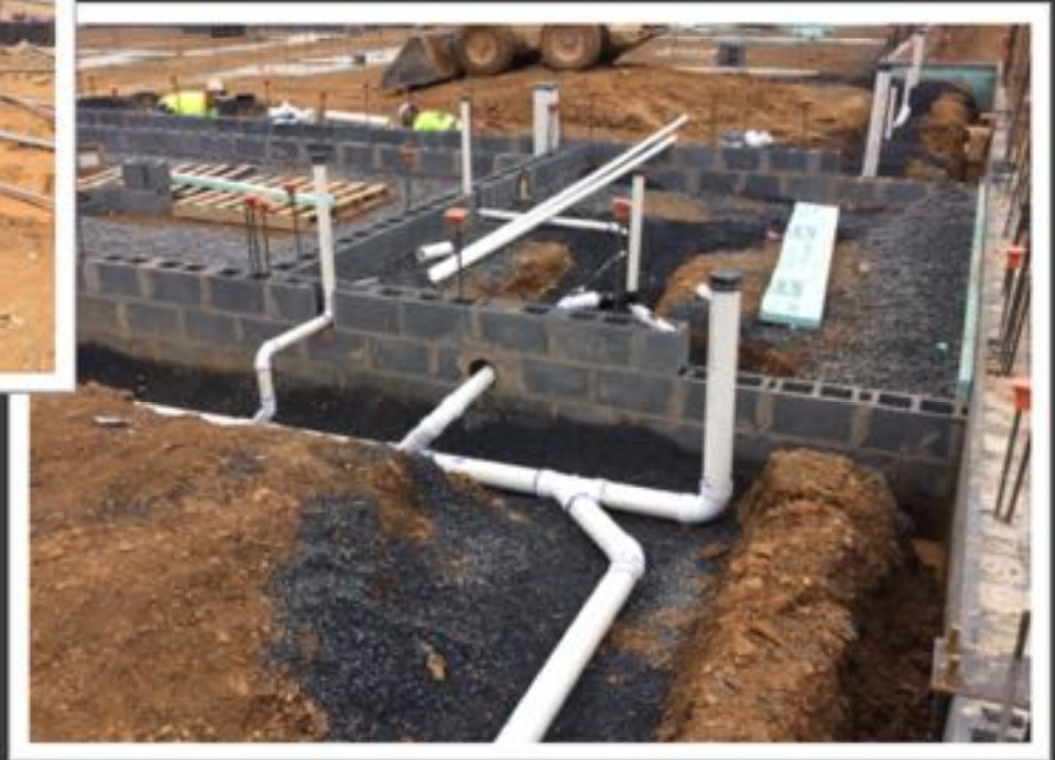
Area C – Sanitary plumbing rough-ins