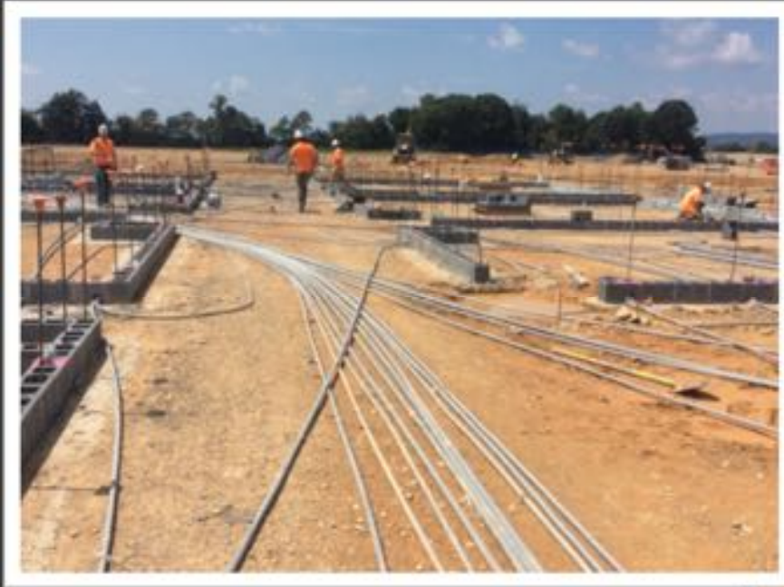
Area B - Electrical under slab conduit rough-in at corridor