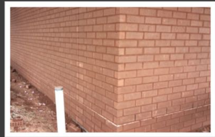
Typical exterior masonry wall profile